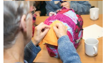
Mary's planet is growing in size and shape.