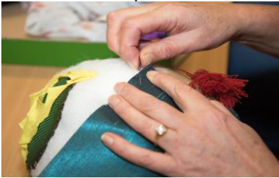
We are learning sew many skills from this project☺